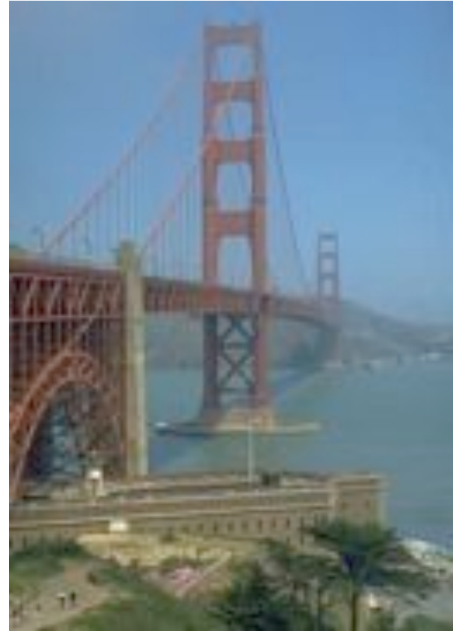
Fort Point under the Golden Gate Bridge - part of the Presidio where one can run trails