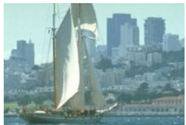
Any boat ride on the Bay