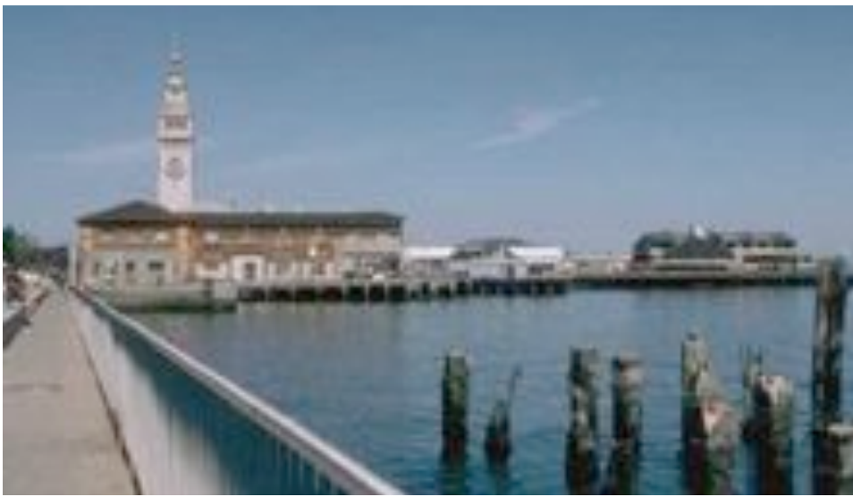
Ferry Building - lots of great eats and views of the East Bay