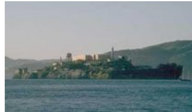
Alcatraz [note: Best to reserve tickets.]