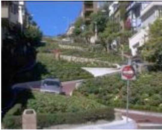
Lombard Street - World's Crookiest Street