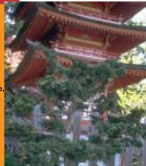
Japanese Tea Garden in Golden Gate Park