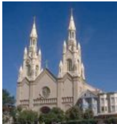
St. Peter & Paul Church in North Beach (Italian District)