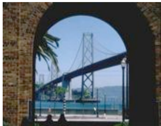
Oakland Bay Bridge & Treasure Island