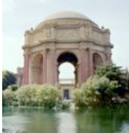
Palace of Fine Arts & the Exploratorium